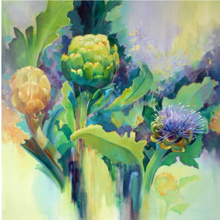
"Artichokes and Lavender" Acrylic, 30" x 34"

In nature I look for things that often go unnoticed. My reverence for nature is expressed by looking close-up for God's presence in all living things.