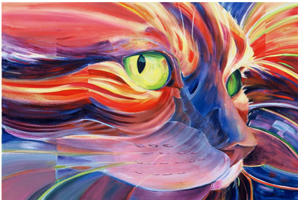
"Pounce" Acrylic, Used as cover art for JAVA magazine

Meanwhile, I raised two boys and worked for ten years in my husband's animal hospital where I was secretly collecting ideas for my animal paintings. After completing my art education at Auburn University in 1969, I taught watercolor, acrylics and creative painting in Florida and Georgia.