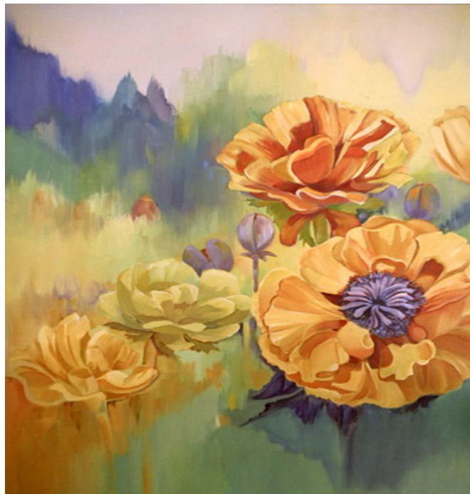
"Poppies" Acrylic, 22" x 28"

In nature I look for things that often go unnoticed. My reverence for nature is expressed by looking close-up for God's presence in all living things.