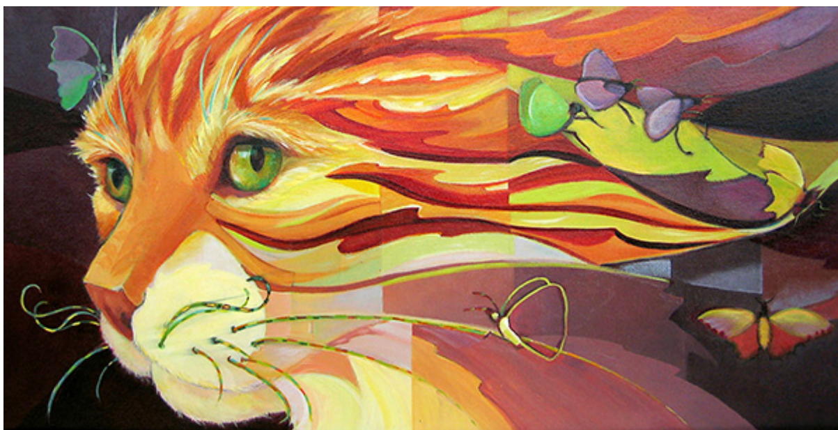
"Dali Cat" Acrylic, 20" x 10"

Painting is what I am compelled to do and the process is the best part of the journey. When I am painting, I get lost in the world I am creating and life is good. I often spend three weeks on a painting mulling over what moves me about my subject, then drawing, layering color, adding texture and glazing. I graciously accept advice on the anatomy of my animals from my veterinarian husband.