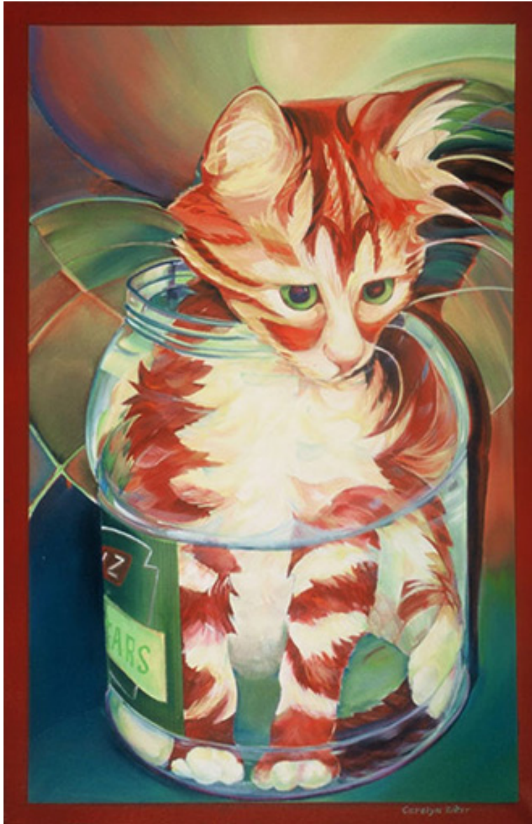
"In a Pickle" Acrylic, 11" x 18"