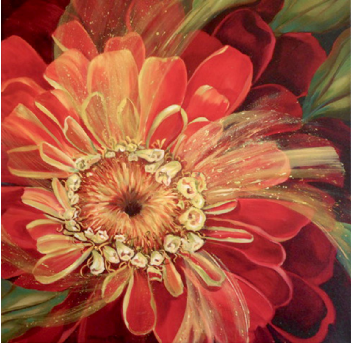
"Zinnia" Acrylic, 24" x 24"

My botanicals have been in numerous juried shows in Florida and Georgia including solo exhibits at the Botanical Gardens of Georgia and Callaway Gardens.