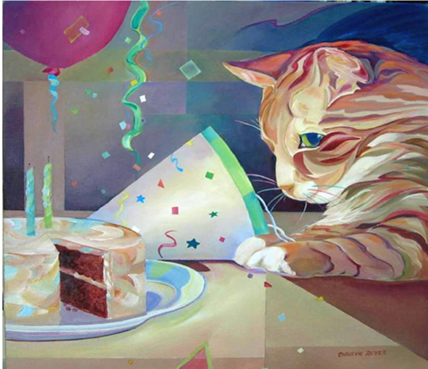
"Party Animal" Acrylic, 24" x 24"

Meanwhile, I raised two boys and worked for ten years in my husband's animal hospital where I was secretly collecting ideas for my animal paintings. After completing my art education at Auburn University in 1969, I taught watercolor, acrylics and creative painting in Florida and Georgia.