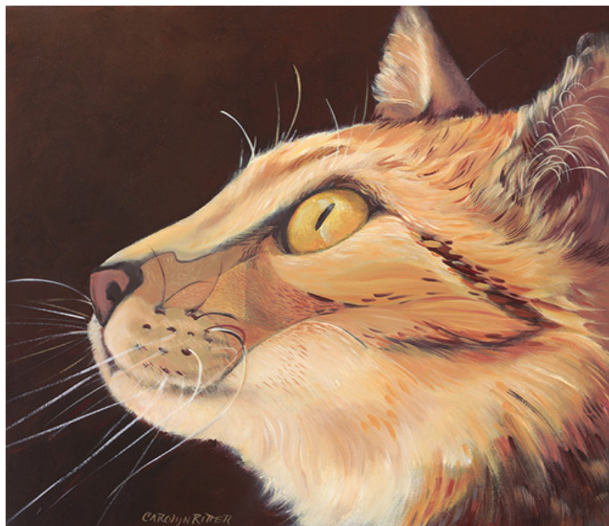
"Eyeballing Sparrows" Acrylic, 20" x 20"

Painting is what I am compelled to do and the process is the best part of the journey. When I am painting, I get lost in the world I am creating and life is good. I often spend three weeks on a painting mulling over what moves me about my subject, then drawing, layering color, adding texture and glazing. I graciously accept advice on the anatomy of my animals from my veterinarian husband.